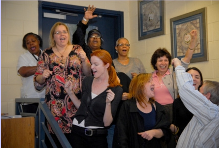
Actress and DWC Volunteer Marcia Cross performs a lively karaoke routine with DWC Ladies, staff, and fellow volunteers on Thanksgiving Day 2009.

Thanks, in large part, to our wonderful volunteers and donors, DWC's 2009 holiday season was one of our most successful yet! In addition to seeing a record number of volunteer sign-ups, we received all items on our Wish List - providing Christmas presents for all women who celebrated with us. Our Day Center Participants and Residents also experienced memorable events in honor of Thanksgiving, Chanukah, Kwanzaa, and New Year's Eve through delicious meals, festive decorations, and exciting entertainment provided by the community. Thank you for making DWC a part of your life during this important time of year!